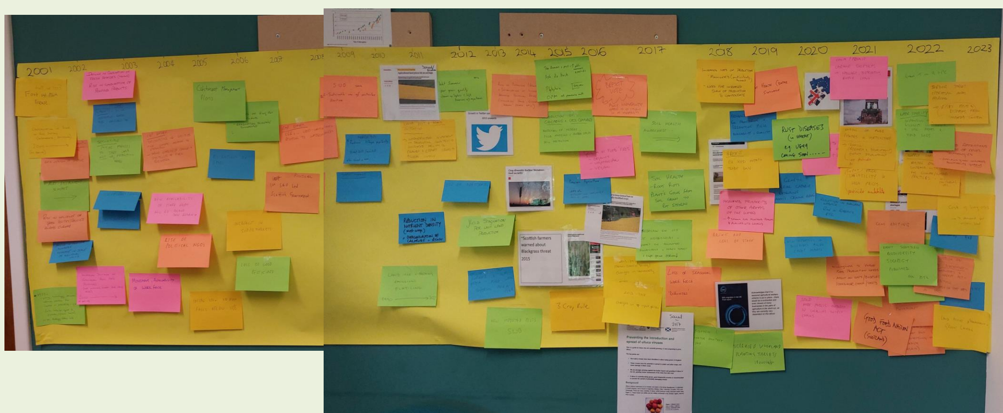
Five STEEP factors used as a framework:

Workshops with agriculture stakeholders to characterise future drivers of change based on analysis of past events