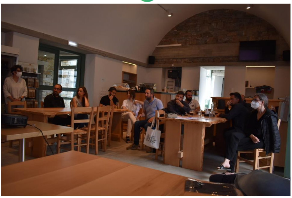
Crete youth engagement workshop, June 2022