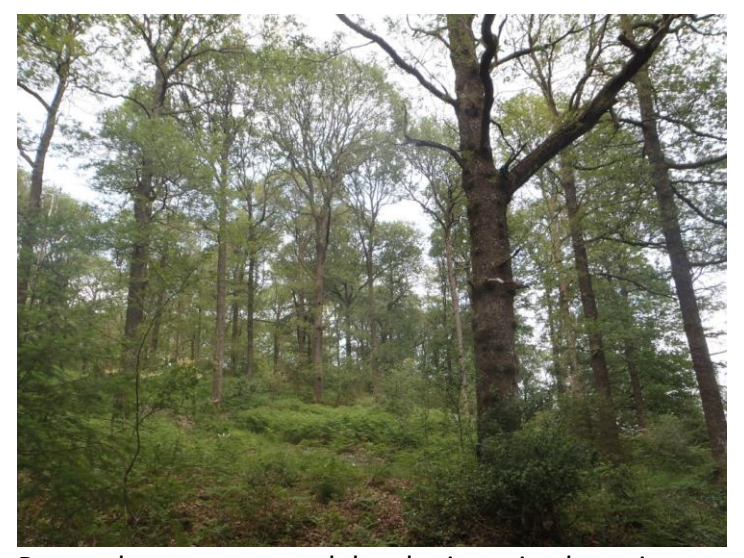
Pure oak overstorey and developing mixed species understorey at Scale Green